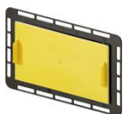
WC installation frame for Prevista Model Number 8651.1