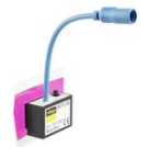
Radio receiver Model Number 8570.58