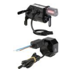
Accessory set Model Number 8655.11