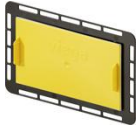
WC installation frame for Prevista Model Number 8651.1